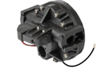
Replacement Smart Sense Pump head with Water Sensor