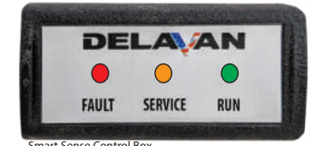
Smart Sense Control Box

Motor: Type: 12 VDC permanent Magnet totally enclosed, non-ventilated. Leads: 14AWG, 6" long Duty Cycle: See Heat Rise Graph Temperature Limits: Motor is not equipped with thermal protection. For user safety, optimal performance, and maximum motor life, the motor temperature should not exceed 180°F (66°C) (See heat Rise Graph). Pump Type: 5 Chamber positive displacement diaphragm pump, self priming, capable of being run dry, demand or bypass. Liquid Temperature: 140°F (60°C) Max. Priming Capabilities: 14 feet (2.5m) Max Pressure: 60 PSI Inlet/Outlet Ports: Quick Attach 3/4" Threaded 1/2" FNPT