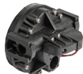
Replacement Pump Heads will fit on any Quick Change Motor