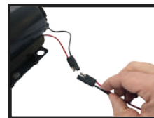
1. Disconnect electrical connections to pump.

Delavan Fluid Power new Quick Change™ Technology allows users to quickly and efficiently replace their pump head while minimizing downtime at the job site. The pump head is considered a consumable part and the diaphragm and valves will wear with use. Delavan recommends replacing Quick Change pump head every 2-3 years depending on usage or immediately after failure (leak). The only tool you will need to replace your pump head is a 1/4" Allen Key.