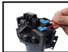
2. Remove the two flag connectors from the pressure switch. (Demand Only)