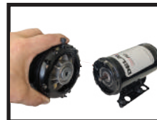
4. Twist and remove the pump head from the motor body.