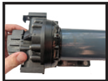
7. Push on pump head until flush with motor and twist counter clockwise until it stops.