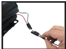
10. Reconnect power to the pump.