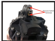
8. Locate the top and bottom electrical terminals of the pressure switch. This is where you will connect the flag connectors. (Demand Only)