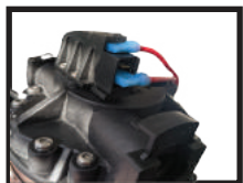
9. Connect flag connectors. Ensure leaving the center connector blank.