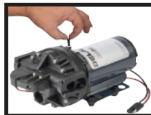
3. Remove thumb screw from pump head. Use of a 1/4" Allen Key may be necessary.