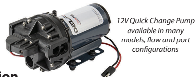
12V Quick Change Pump available in many models, flow and port configurations

Inlet/Outlet Ports: Quick Attach 3/4" Threaded 1/2" FNPT