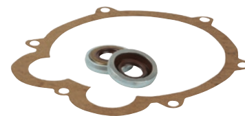
28455-2 Lip Seals Repair Kit

*A 1000-RPM PTO coupler must be used. The Turbo-90 can be operated at lower speeds, but the capacity diminishes dramatically with speed – at 540 RPM the capacity is almost zero. A choice of four quick couplers is available.