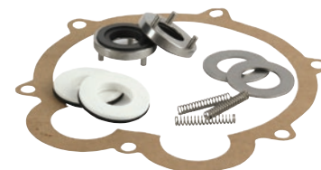
28455-1 Face Seals Repair Kit